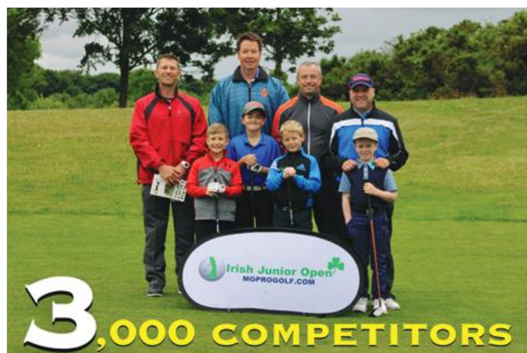
Over 3,000 Competitors since the beginning in 2014