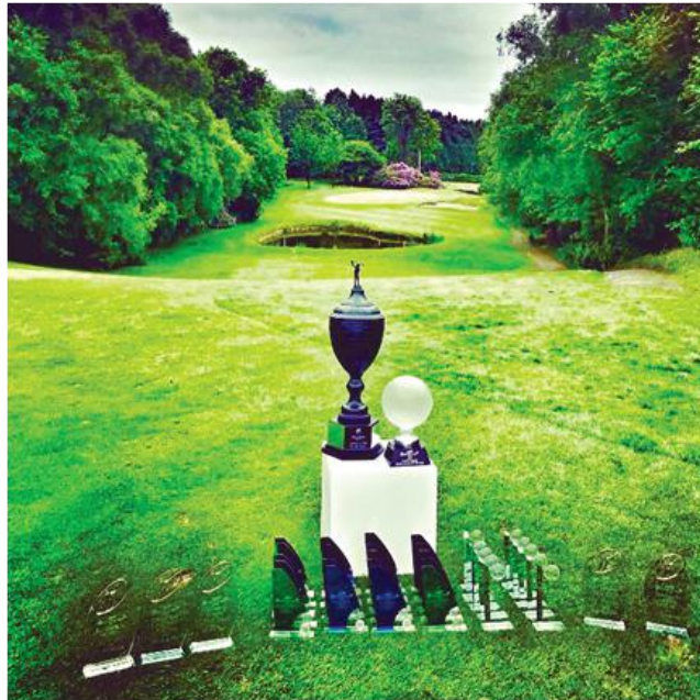
A selection of our trophies won in 2018