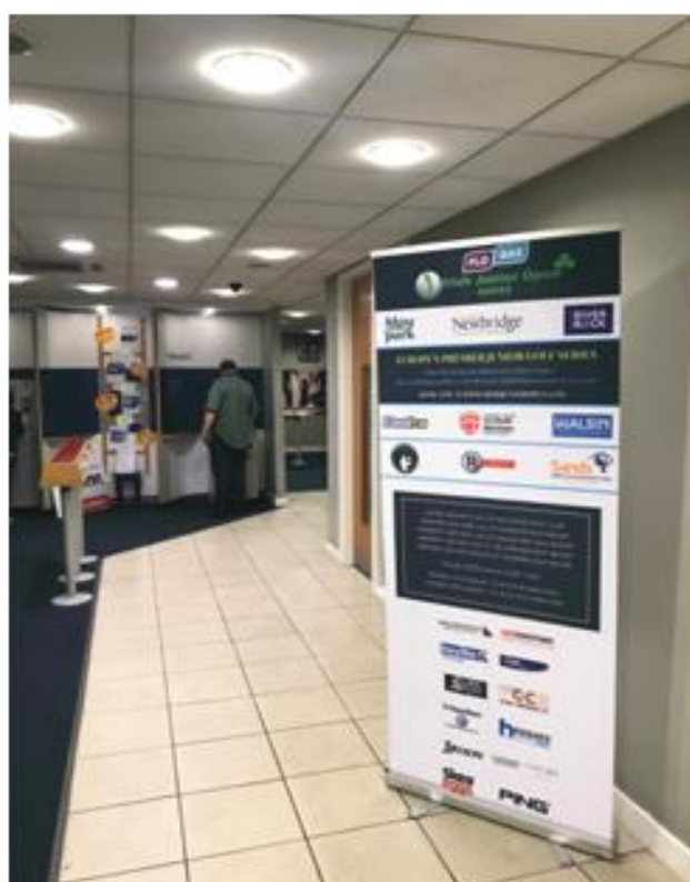
Bank of Ireland Advertising