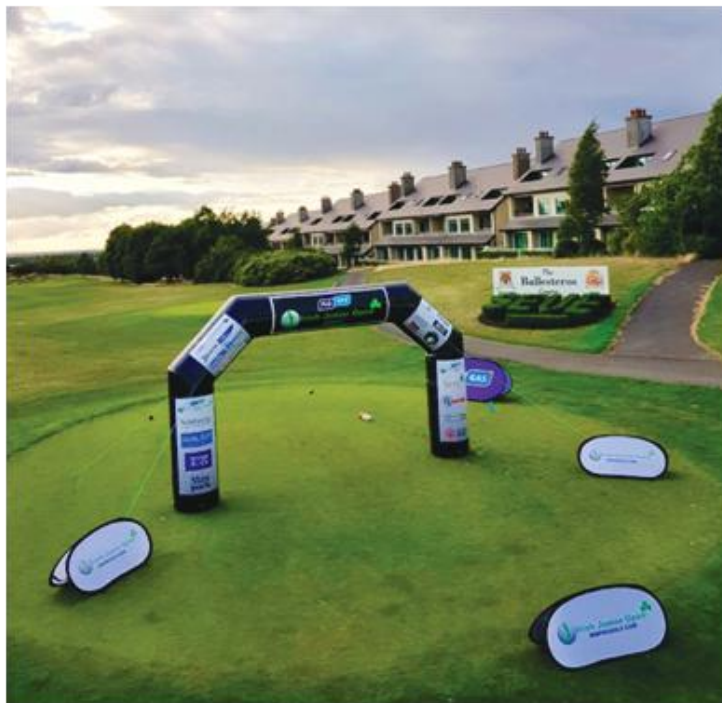
1 st tee advertising at all our host golf courses throughout Ireland