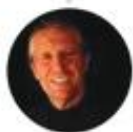
Gary Player ✓ @garyplayer