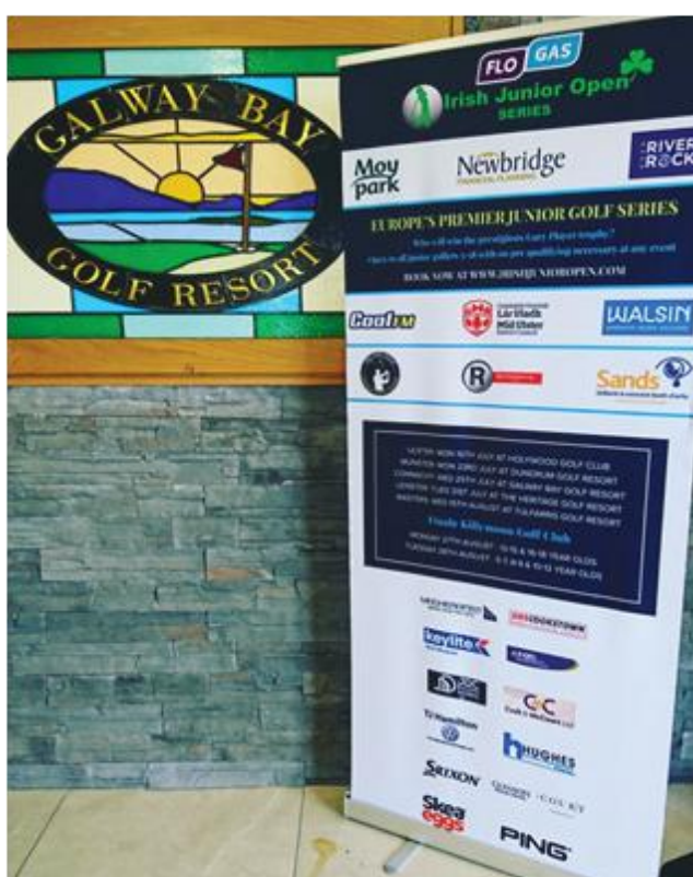
Host Golf Courses Advertising