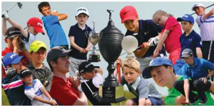
Some of our 1,000 competitors in 2018