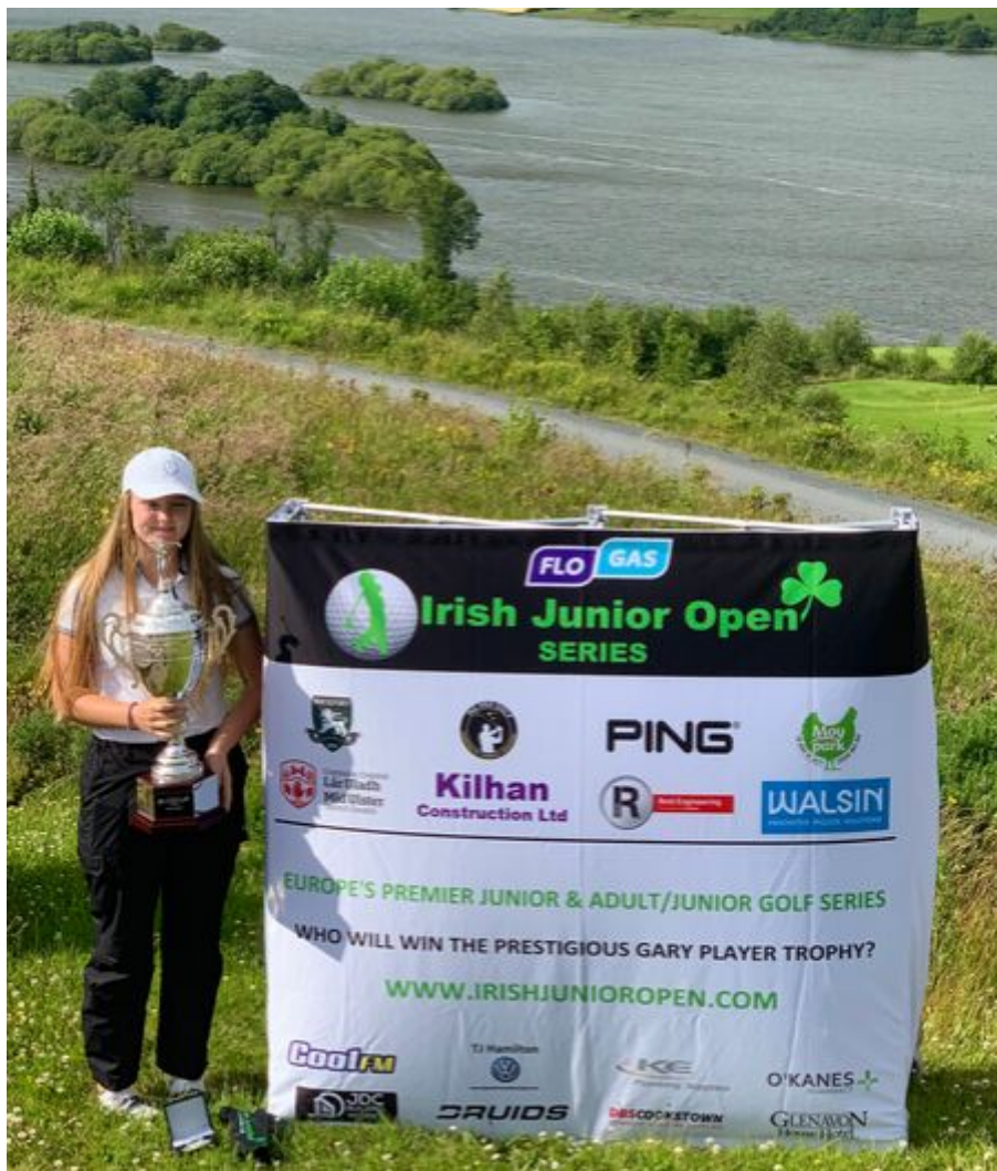
PRIZE WINNERS SPONSORS ADVERTISING