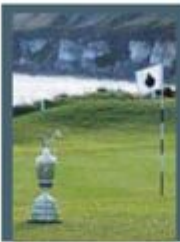
2019 OPEN COURSE Magnificent Royal Portrush