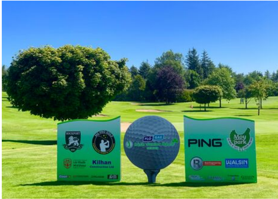
1ST TEE SPONSORS ADVERTISING