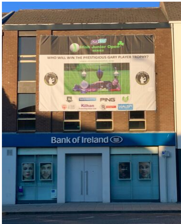
MAIN STREET 6X4 METRE SPONSORS ADVERTISING